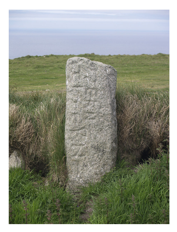
Figure 7: Early Christian memorial stone, Lundy.

English Heritage's research themes and priorities for prehistory are set out in its draft research strategy. Priorities which are immediately applicable to the SW strategy include developing integrated approaches to prehistoric landscapes; improving understanding of the spatial, typological and chronological context of prehistoric sites and monuments; and raising awareness of the significance of "sites without structures" through improved understanding of ephemeral sites, especially lithic scatters.