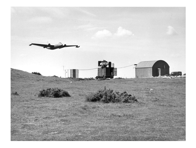
Figure 8: An English Electric Canberra flies low over experimental radar equipments at Westbury Beacon, Somerset, in 1962.

local societies and individuals to academics and metal detectorists. There are key links to the industrial archaeology sector. A priority should be considered to map and record the less popular areas of 20th-century defensive activity, including infrastructure, landscape and temporary features. Regional/local seminars would provide direction and/or training.