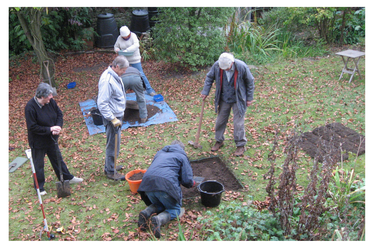
Figure 2: Westbury Society members opening up their first test pit in Westbury-sub-Mendip.

undertake research and survey for English Heritage, Natural England, local authorities and others.