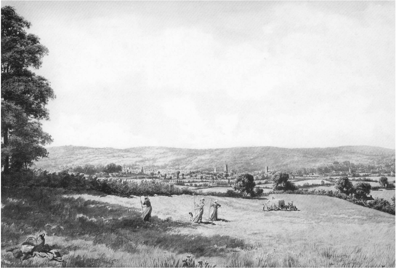
Figure 9.2: Taunton from Cotlake Hill in 1899. This view from just below the summit shows the northern tip of the hill, with Taunton and the Quantock Hills in the background. The near-level area beyond the hay wagon appears to be a stream terrace, beyond which the land drops some 20m to the floodplain of the present Sherford Stream. The position of the wagon marks the upper limit of a prolific surface scatter of palaeoliths, most of which have been carried downslope in Head or hill-wash from the higher parts of the hill. From an original painting by Harry Frier (1849–1921), courtesy Taunton Deane Borough Council.

and the M5 motorway at Kibbear (see Figure 9.1 on page 54). Forming an interfluvium between the Sherford Stream and the Black Brook, this area is dominated by Cotlake Hill which, at 73m OD, is a prominent landmark overlooking the town.