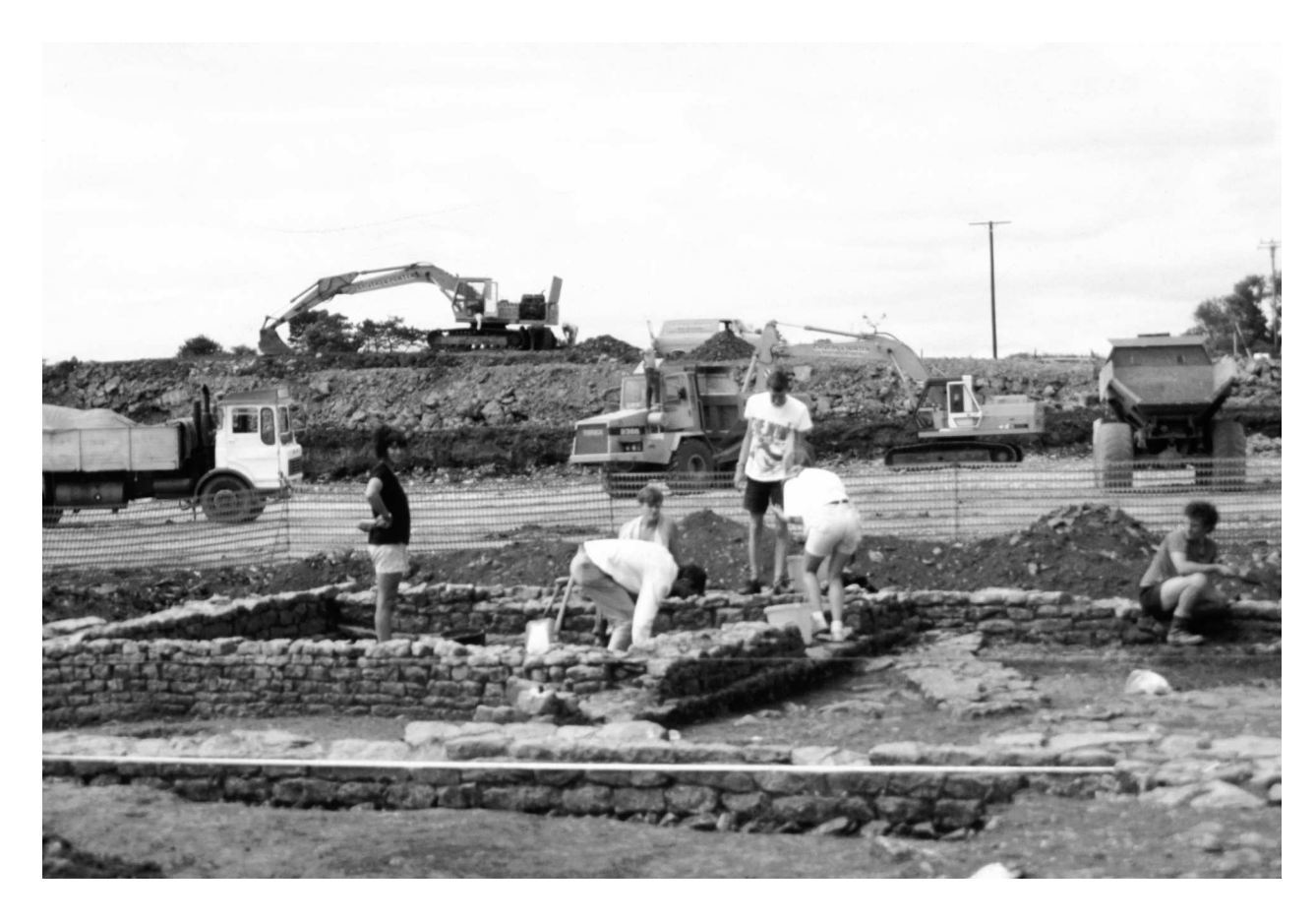
Figure 21.2: The discovery and excavation of the Roman town at Fosse Lane, Shepton Mallet in 1989–1990 revealed extensive remains of a Roman roadside settlement. Part of the site was excavated in advance of development and a substantial part is now protected by scheduling.

tant that adequate guidance and direction is made available by central government through English Heritage.