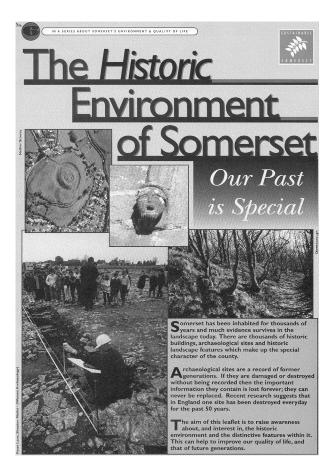
Figure 21.4: It is important to provide accessible information about the historic environment of the county to remind people that their past is special.