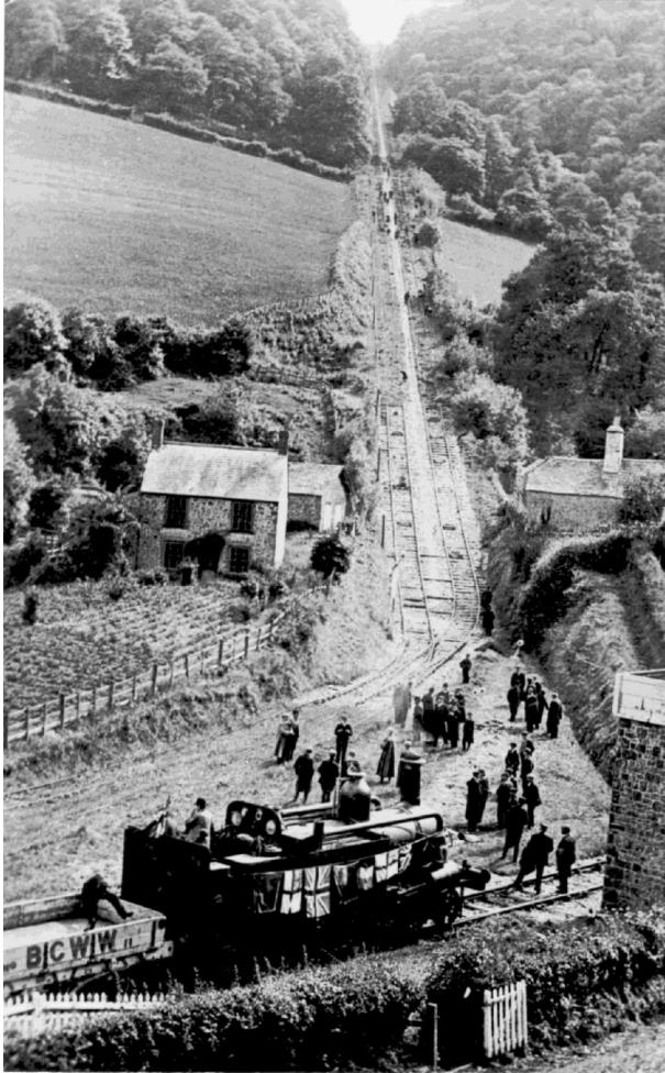
Figure 19.2: The Brendon Hill Incline in operation

survey of all the farmsteads of the national park, to provide guidance for the grant scheme, as well as basic data on the form, functions and age of farms across Exmoor.