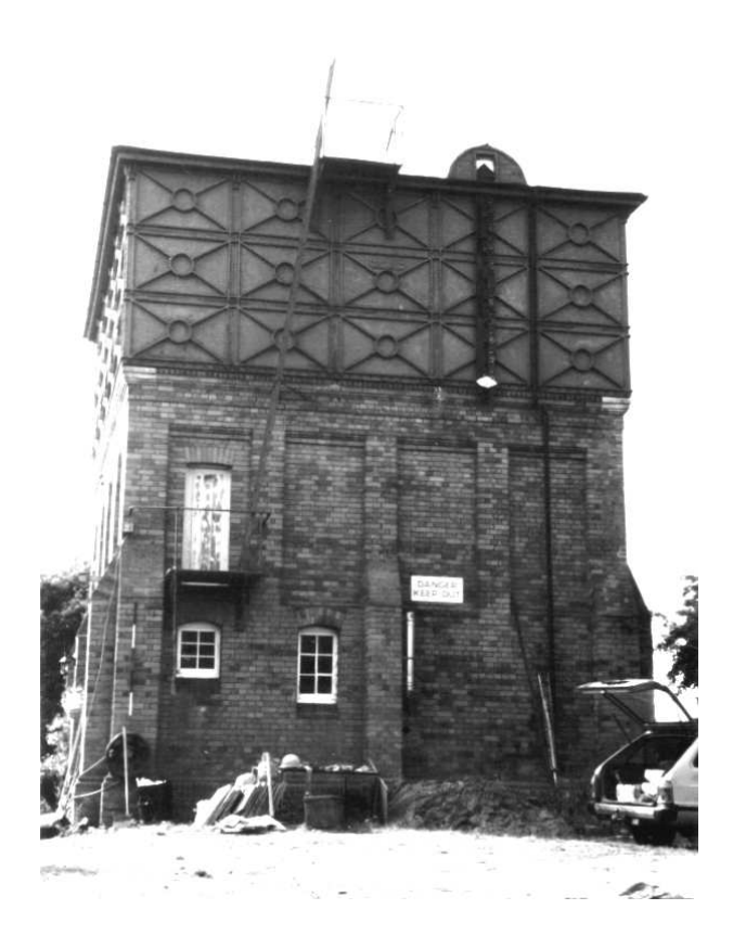
Figure 18.3: An industrial archaeological problem – Dark Lane Water Tower, Wellington. This unlisted, redundant structure was altered to extend domestic accommodation but recording was assisted by the discovery of the original construction drawings of 1896 (Murless 1995).

(Aston and Leech 1977), have now found expression in selected Extensive Urban Surveys (eg Gathercole 1998). But survival is never assured, the former silk mill and later collar factory at South Street, Taunton, falling victim to "brownfield site" planning policy in 1998. Assessment of the degree of importance of sites of certain industries has begun with English Heritage's Monuments Protection Programme (English Heritage 1999). Coal mining in Somerset, which has its own gazetteer (Gould 1999) has been shown to have monuments of national significance including the unique coking ovens at Vobster (Instone and Cranstone 1994).