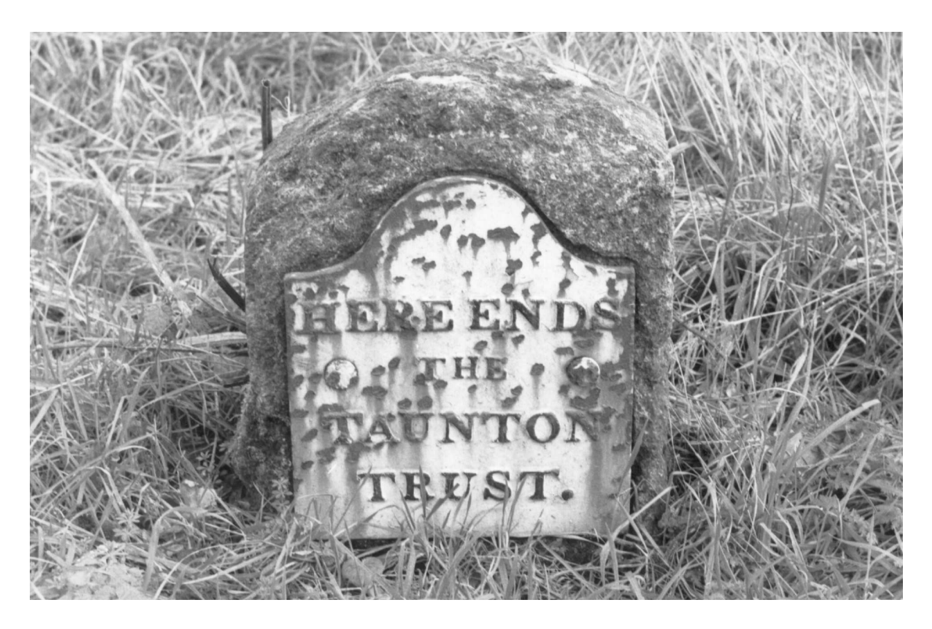
Figure 18.5: The terminus stone of the Taunton Turnpike Trust at Tolland was destroyed but the plate retrieved and is now the subject of a Millennium reinstatement project.

is essential if decisions on planning applications are to be influenced and positive outcomes managed such as adaptive re-use of disused industrial buildings, the designation, where appropriate, of statutory protection, site access for archaeological work and high standards of recording where demolition occurs (Daniel 1999). Good relationships between fieldworkers and authority officers remains of vital importance, a favourable "sea change" which began with the appointment of Mick Aston as County Archaeologist in 1974. This has permeated to district council levels and will hopefully be on-going to the parishes as the aims of Local Agenda 21, which include the safeguarding of the historic heritage, are pursued (Stokes 1999). Only when industrial archaeology is firmly established at the grass roots will any lingering misconceptions about our industrial past be finally laid to rest and the relics of a revolution take their rightful place in a multi-period Somerset landscape.