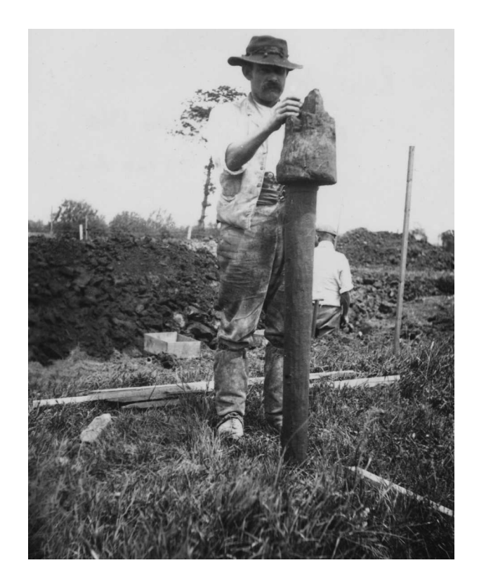
Figure 12.2: Large wooden objects such as this "knobbed pile" were re-buried on the site of Glastonbury Lake Village in an attempt to preserve them for the future.

Unlike Tratman and Clarke, Coles and Minnitt examined, in detail, all the surviving records the published volumes, notebooks, finds catalogues, correspondence, photographs, reports from original specialists, etc. New specialist reports were commissioned to study aspects felt to be of particular value to the reassessment - the environmental setting of the site and certain categories of artefacts including the metalworking evidence, human remains, stone, glass and worked bone and antler. Whilst many problems were encountered the quality of the evidence was high for the period of the excavations and enabled the identification of a site history based upon four phases and the elucidation of social and economic activity. As this work is already published elsewhere (Coles and Minnitt 1995) the details will not be elaborated on. It should be stressed, however, that the analysis was not comprehensive, there remains much scope for further detailed studies, particularly of the artefacts.