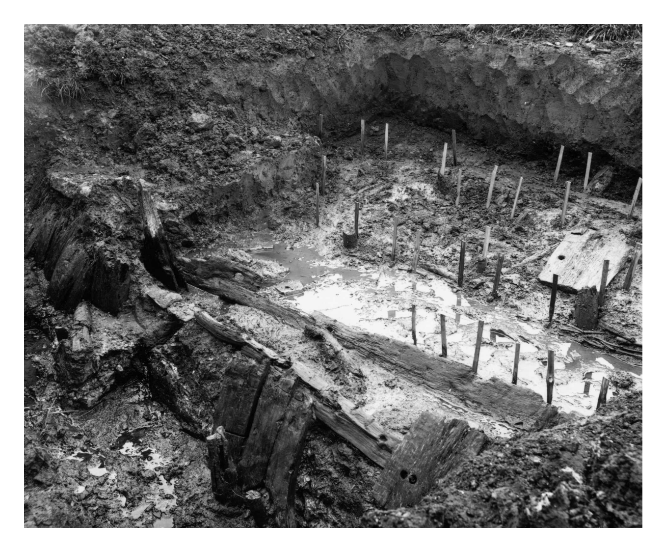
Figure 12.1: A previously unpublished photograph of the 1893 excavation of a probable iron-age site at Crannel Farm.

transport in the Iron Age. Besides the Crannel Farm find these include the Shapwick canoe retrieved in 1906 and now in the Somerset County Museum, a damaged log-boat utilised in the Glastonbury Lake Village foundations and "Squire Phippen's big ship" which was discovered and subsequently broken up for use as fuel in the first half of the nineteenth century (Stradling 1849, 52).